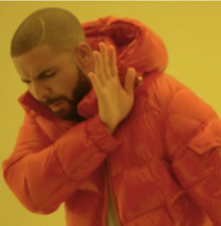
Go to the bathroom during study hall