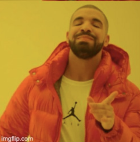
Go to the bathroom at the start of your next class