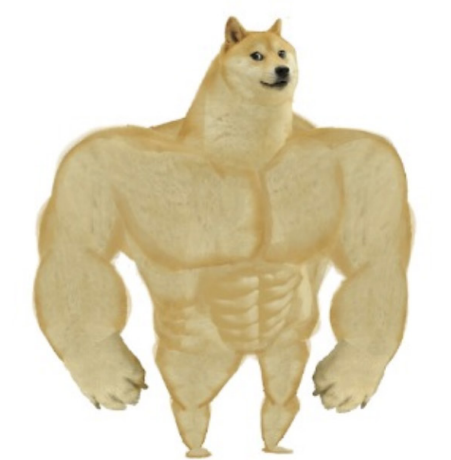
Team Captain-led fitness during lunch!!