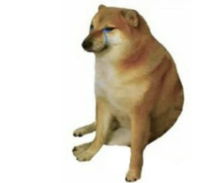
Runny-runs makes me muskles hurt-ikins!