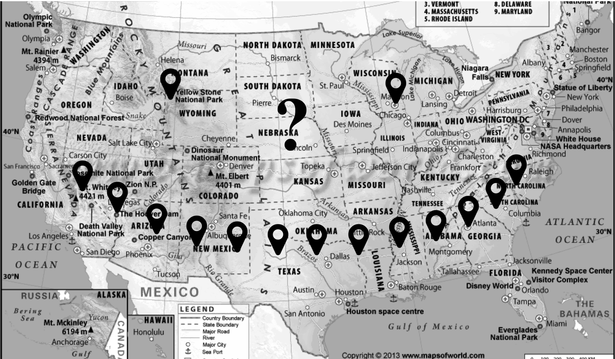
Above: The college selections of the graduating seniors arrange out to form a mysterious smiley face on a map of the United States.