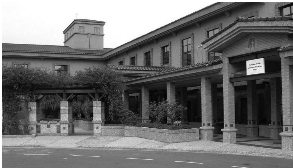
Above: MAK's campus will be closing this year.