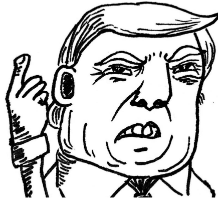
A portrait of Donald Trump gesturing angrily. // Art by Alice Lin

paraphrase or to implement my own opinions.