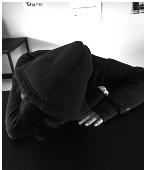
A senior gives up on studying for a physics test.

Whether the trip to Telunas was a strategic move in disguise is one of the many classified secrets at MAK. The result, however, outweigh the "deteriorating morals," "ironic ideals," and "ignorance to sentiments" the left-wing activists accused the trip of. The class of 2017 is a much more unified class that "is now showered with newfound peace" after ridding itself of Student A.