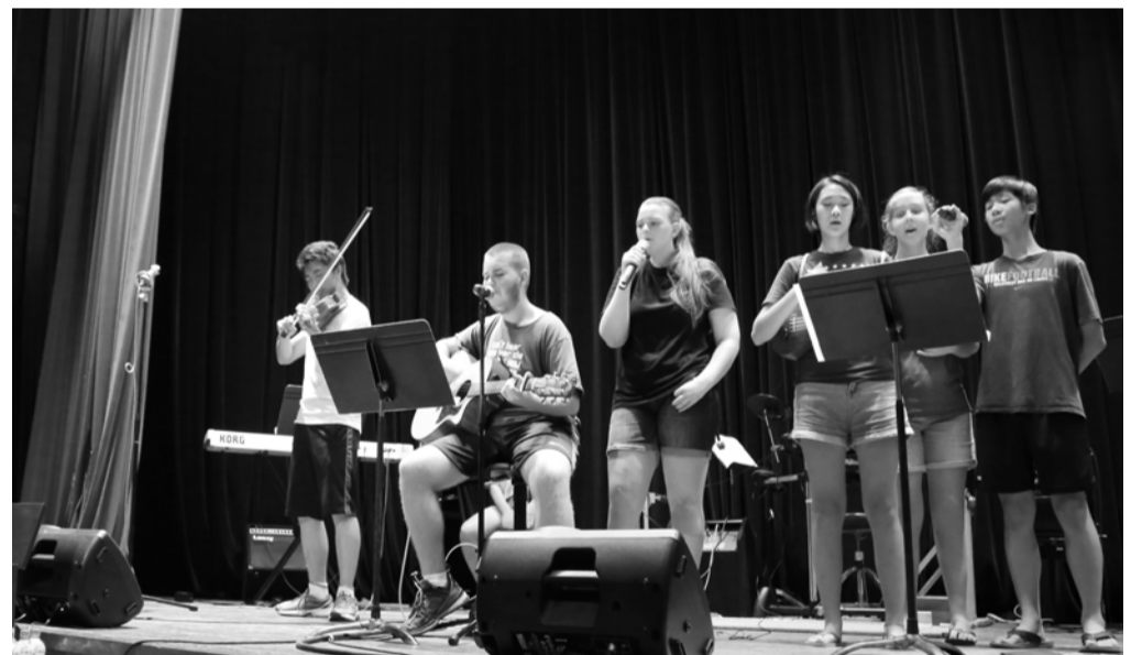
MAK high school worship team led worship for Catalyst on Friday night.